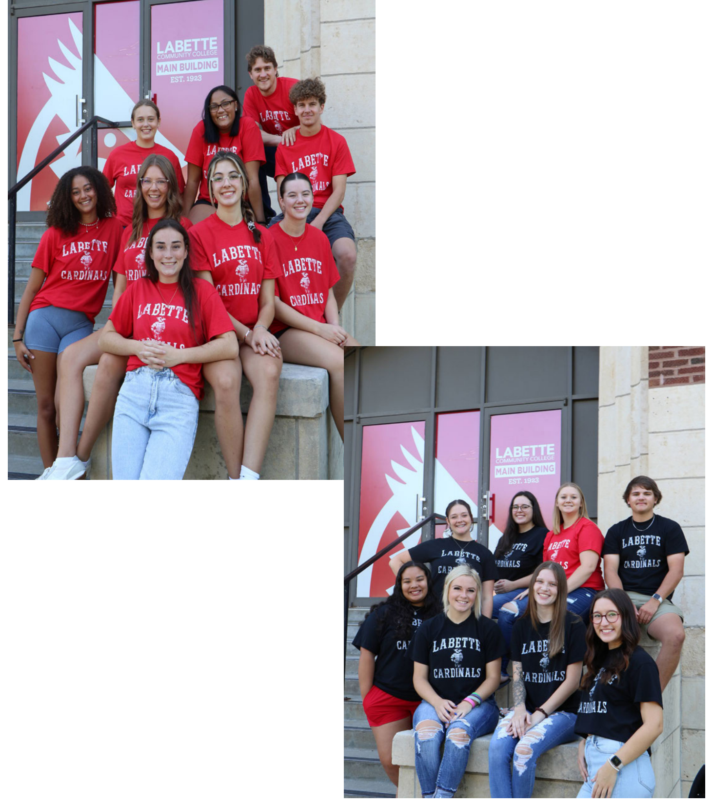
General Electives can be found on page 53 Statewide General Education Requirements can be found on page 56