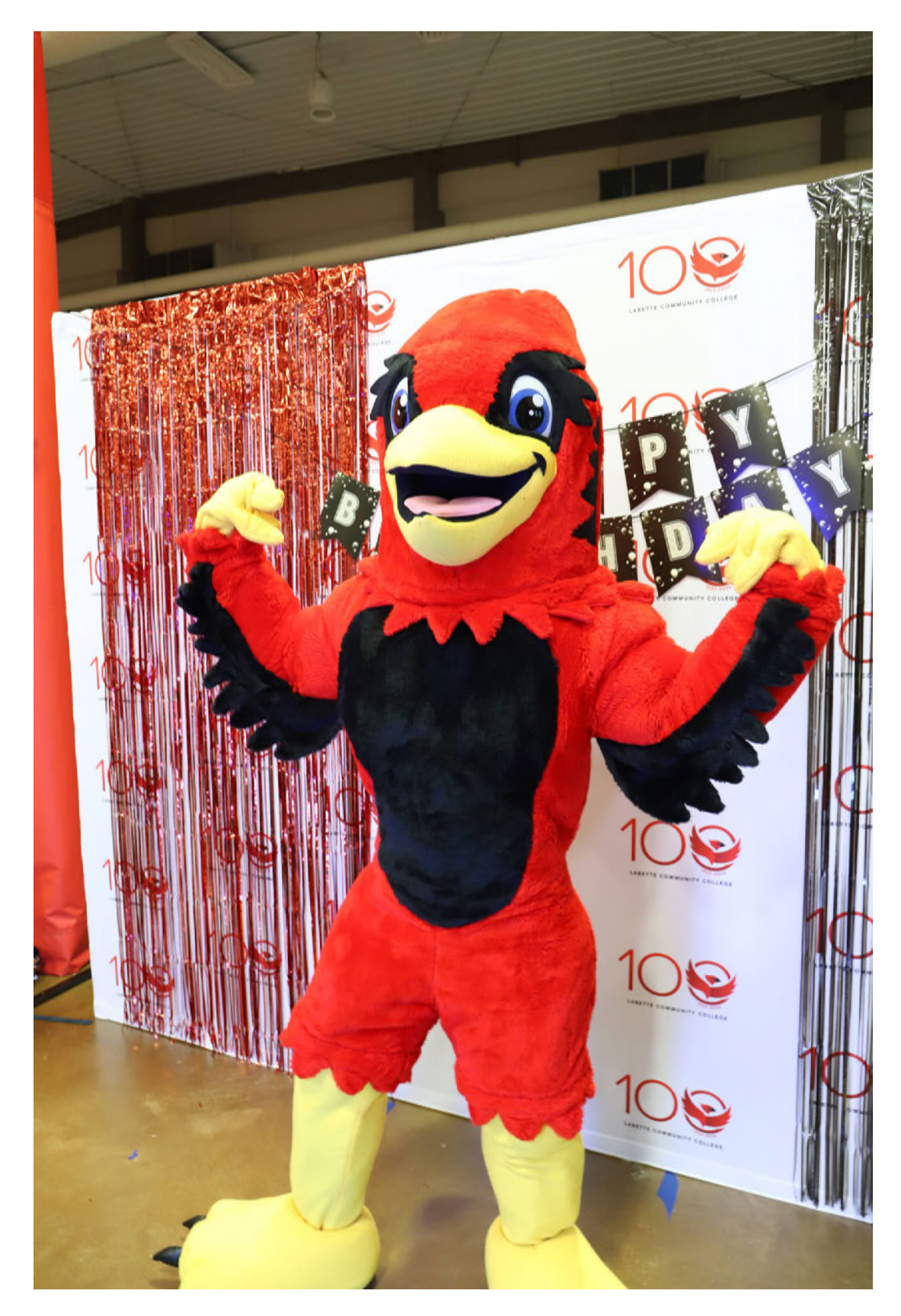
General Electives can be found on page 53 Statewide General Education Requirements can be found on page 56