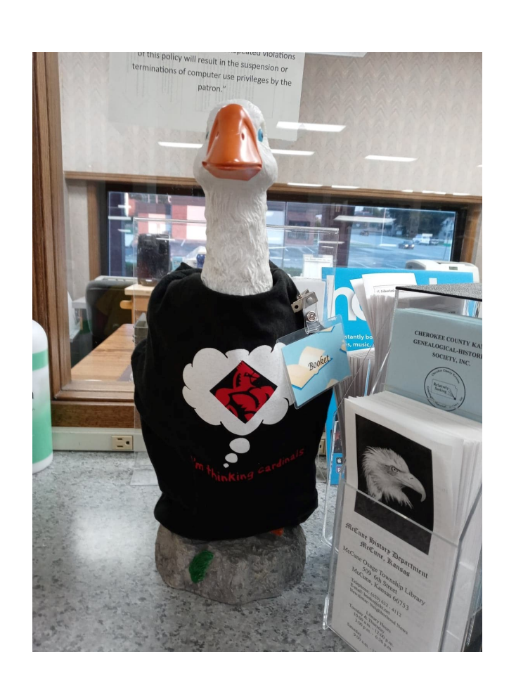
Come check things out @ your library!